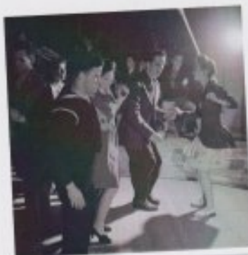
Jitterbugs at an Elk's Club, Washington DC

Visit our blog www.fiftyfifty2015.wordpress.com for more about Zihan and the collaborators.