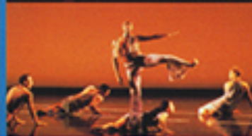
SMOKE R. FULLER